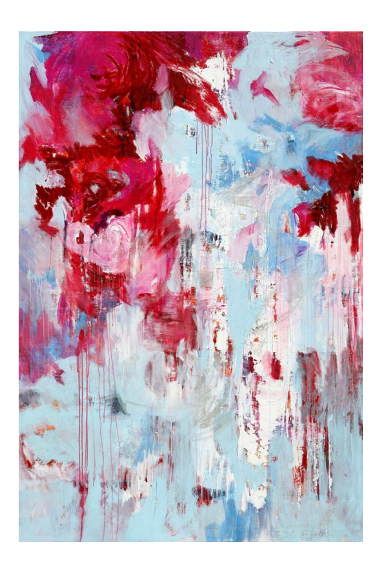
BLütenzauber Magic of Flowers Mixed media on canvas 210x140 cm, 2018