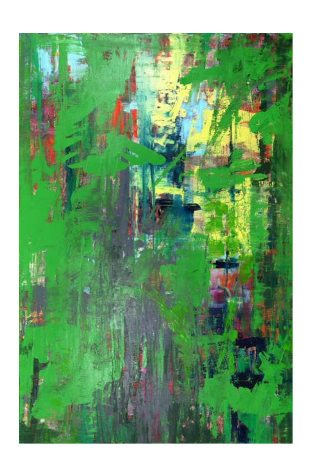
Rainforest Mixed media on canvas 180x120 cm, 2017