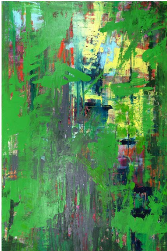
Rainforest Mixed media on canvas 180x120 cm, 2017